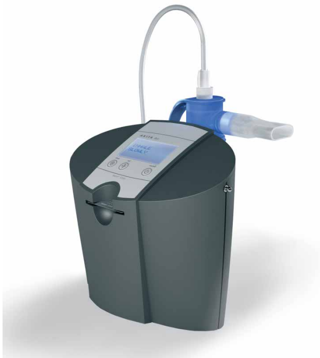
FIGURE 1 AKITA Inhalation System (Activaero GmbH, Gemuenden, Germany).

Patients ( \geq 18 and \leq 65 years) in this randomised, parallel, placebo-controlled trial had asthma ( \geq 6 months; allergic or nonallergic; American Thoracic Society (ATS) definition, pre-bronchodilator forced expiratory