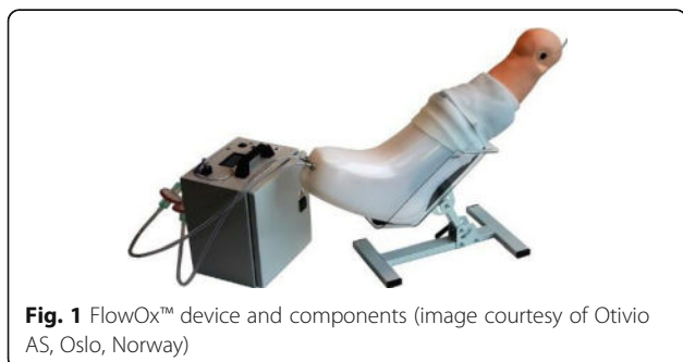
Fig. 1 FlowOx™ device and components

Patient interviews were conducted at the participants convenience either at the hospital sites or in their own