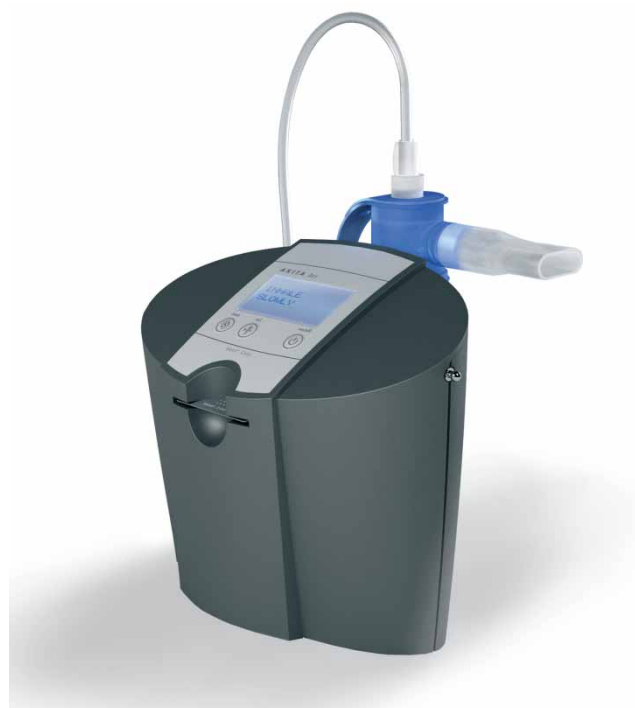
FIGURE 1 AKITA Inhalation System (Activaero GmbH, Gemuenden, Germany).

Patients ( \geq 18 and \leq 65 years) in this randomised, parallel, placebo-controlled trial had asthma ( \geq 6 months; allergic or nonallergic; American Thoracic Society (ATS) definition, pre-bronchodilator forced expiratory